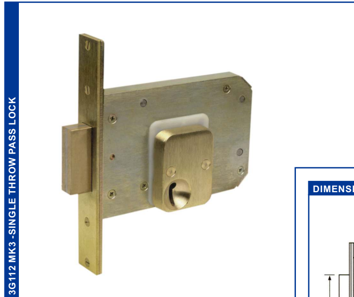
3G112 MK3 - SINGLE THROW PASS LOCK