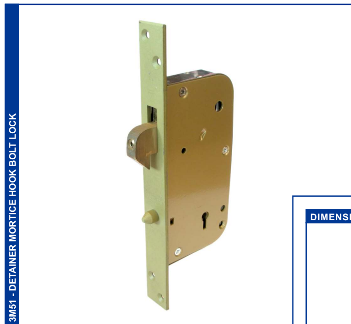
3M51 - DETAINER MORTICE HOOK BOLT LOCK