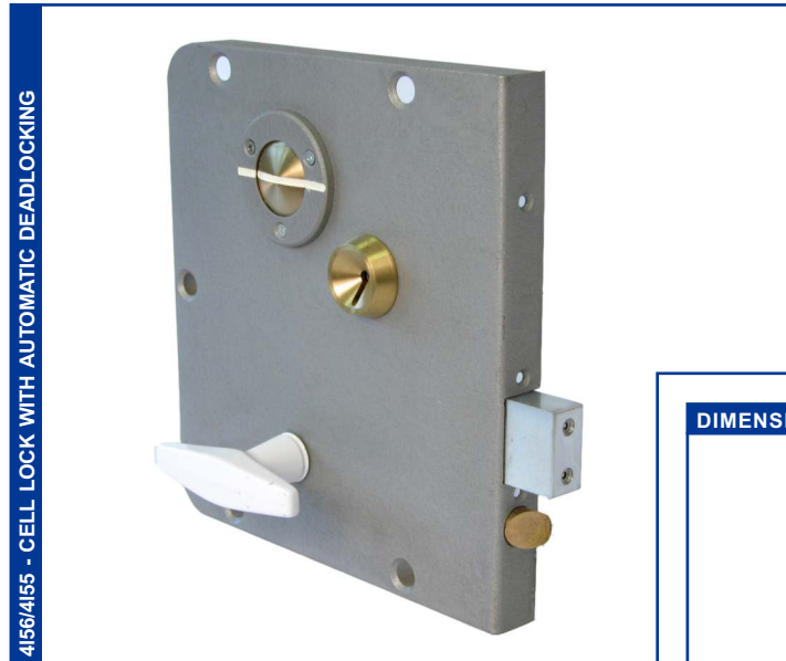
4L56/4L55 - CELL LOCK WITH AUTOMATIC DEADLOCKING